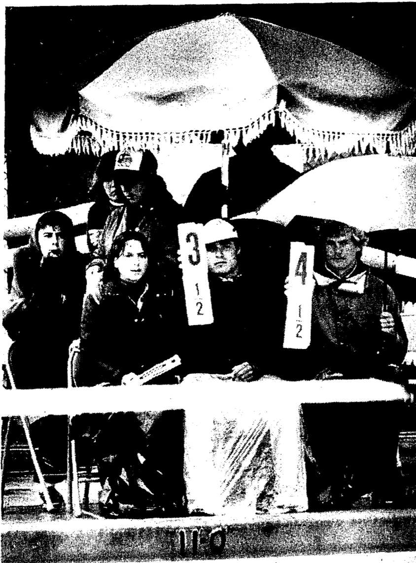
An umbrella offers judges some relief from Tuesday's rain.