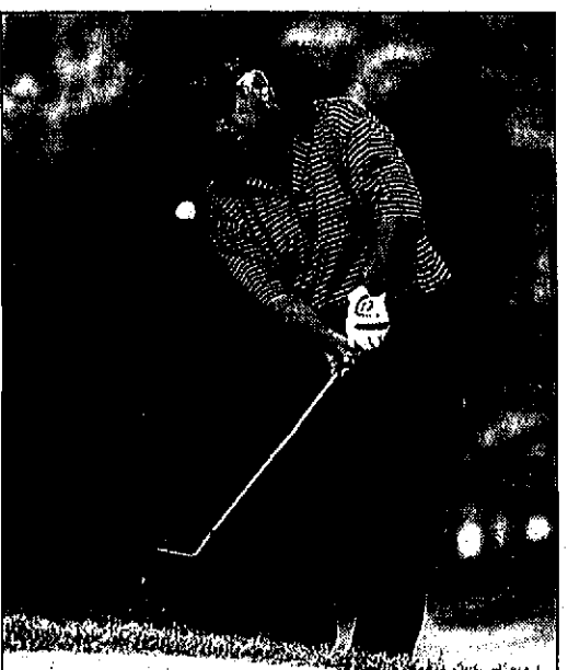
Senior PGA golfer Lee Trevino chips onto the 18th green during the Par-3 Shootout Tuesday in Gaylord, Mich. Trevino won the shootout, earning $1,120,000 which included a hole-in-one Monday.

Bill Simpson, who found himself at the center of controversy following Dale Earnhardt's death, has resigned as head of the company that manufactured Earnhardt's safety belts. Simpson said the stress of the controversy "got to be too much." He has maintained for months that NASCAR made him a scapegoat in the wake of Earnhardt's death. "It's just been one thing after another," Simpson said. "Like I come with new (safety equipment, such as a head-restraint device) and NASCAR takes it away, and they don't give it back. I deserve more respect than that." "The amount of disrespect shown me in